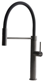
INCISO GUN METAL R424 S56